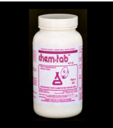
Part #251 – 100 Tablets

Kon-Trole condensate drain pan tablets are the same as Chem-Tab condensate drain pan tablets, a safe pre-measured tablet that keeps the drain pan clean of slime, scum and other accumulations. For better inventory control, they are packaged 6 tablets to a foil blister and placed in an easy to store box.