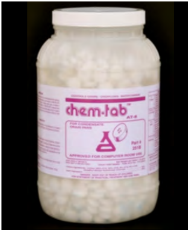
Part #251-B – 1500 Tablet Jar