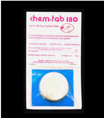
Part #252 – 1 Tablet Card