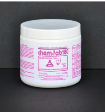
Part #252 – 12 Tablet Jar

CHEM-TAB 180™ tablets with Inviso-Guard protection is a pre-measured, highly effective, surface active agent that cleans slime, scum and other accumulations