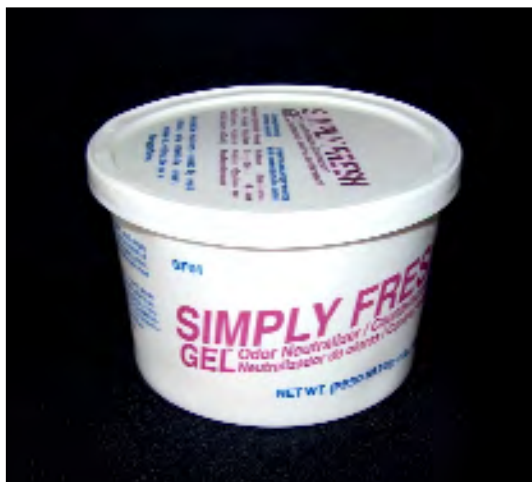
Part # SF-01

SIMPLY FRESH GEL is easy to use. Simply remove lid and place in an area with malodors. For more effective results, turn tub upside down and place the SIMPLY FRESH GEL out of the container on the lid to get more exposure.