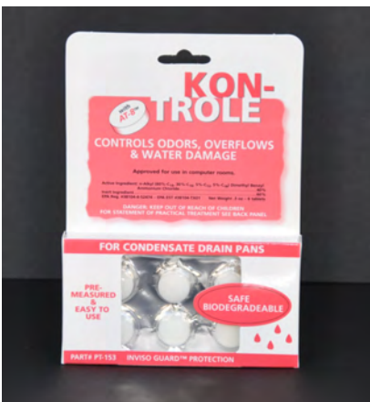
Part #PT-153 – 6 Tablet Card