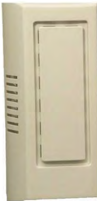
Part # SFB-01 D

Absorbs Odors Right Out Of The Air - Not a Cover Up