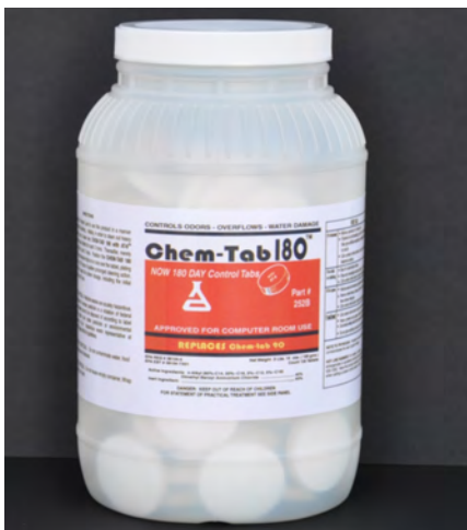
Part #252-B – 125 Tablet Jar