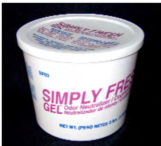
Part # SF-03

SIMPLY FRESH GEL in the one pound tub treats up to a 200 square foot area. It is a long lasting neutralizer that chemically removes malodors from the air. Like the restroom block, it has a pleasant fresh scent to let you know it's still working. When the fragrance is gone, simply replace the tub.