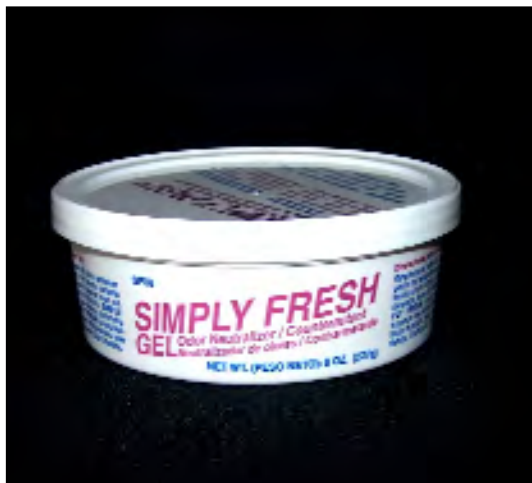
Part # SF-08

Part # SF-08 - 1/2 lb. tub - 18 tubs per case