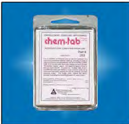
Part # 253 - 6 Tablet Pack

Chem-Tab condensate drain pan tablets is a safe pre-measured tablet that keeps the drain pan clean of slime, scum and other accumulations.